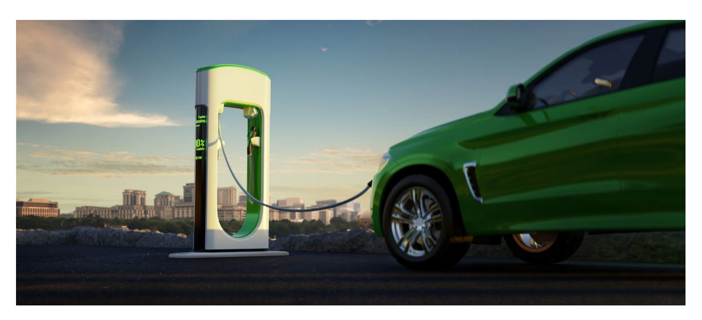
The Air Quality Control Advisory Council June 12, 2023