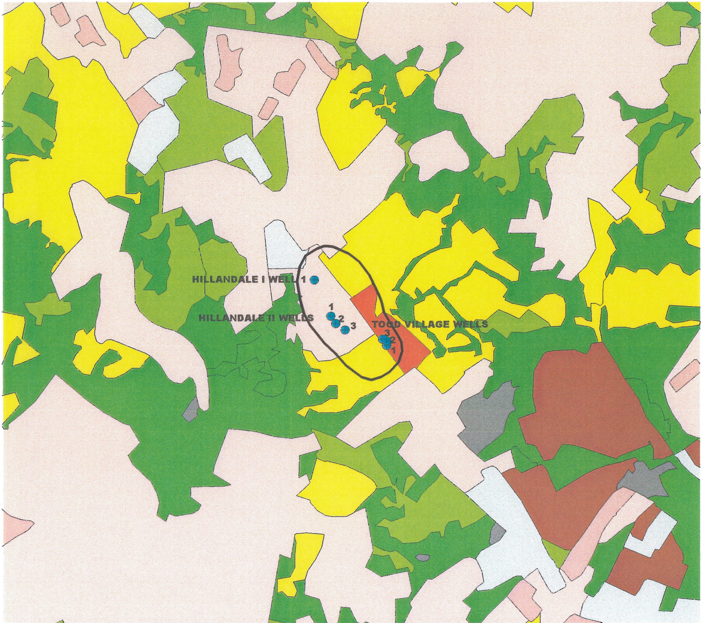
Figure 3. Land Use Map of the Hillandale and Todd Village Mobile Home Park Wellhead Protection Area