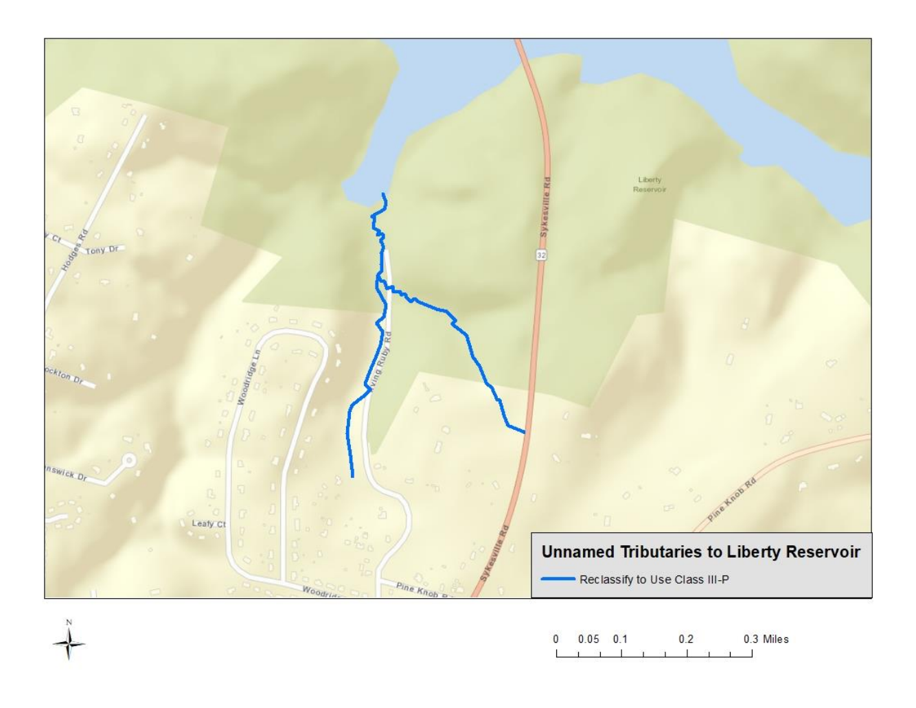
Figure 3: Existing Use Determination of Unnamed Tributary to Liberty Reservoir

Public Review Process : This existing use determination was provided for public review and comment with Maryland's 2019 Triennial Review of Water Quality Standards which went public with the March 11, 2022 edition of the Maryland Register.