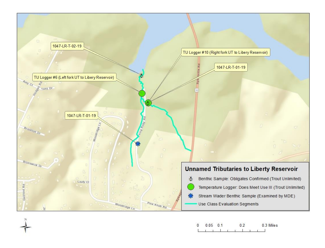
Figure 1: Unnamed Tributary to Liberty Reservoir