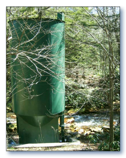
Figure 3 . Partners installed a limestone doser adjacent to Cherry Creek.

alkalinity-producing system that includes a treatment cell designed to precipitate aluminum while keeping iron in a soluble form), a Pvrolusite<sup>®</sup> cell (bioremediation using limestone and bacteria to remove metals), and a Boxholm<sup>®</sup> doser (a system that introduces lime to the water at a given rate). (See Figures 2 and 3.) The Cherry Creek mitigation effort used approximately 6,760 tons of limestone, not including the lime used for the doser.