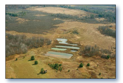
Figure 2 . Partners installed a successive alkalinity-producing system at the Everhart project site.