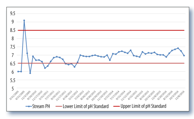
Figure 3. Spiker Run pH has met water quality standards since mid-2013.

In mid-2013 a leachbed and a limestone sand application site were installed to treat AMD flows entering Spiker Run (Figure 2). During the first year, the application site received 34.89 tons of limestone sand. More applications will continue at varying levels depending on stream conditions for the foreseeable future. Following installation of the leachbed and limestone sand application site, MDE's Abandoned Mine Land Division (AMLD) periodically monitored the pH at Spiker Run and scheduled delivery of limestone sand to the application sites as needed.