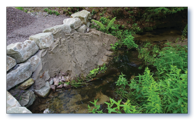
Figure 2. A limestone sand application site was installed at the edge of Spiker Run.

action. The plan also analyzed AMD mitigation technologies. One of the technologies recommended to constrain capital, operation and maintenance costs was limestone sand application, sometimes called a limestone sand dump. This technique involves constructing a driveway for a dump truck to pull up adjacent to the stream so that measured quantities of limestone crushed to sand-sized particles can be delivered directly to stream edge. Then, natural variation in stream flow distributes the particles downstream. The limestone particles raise in-stream pH and increase acid neutralizing capacity. The amount and timing of limestone sand application is determined by periodic monitoring and in-stream pH measurements.