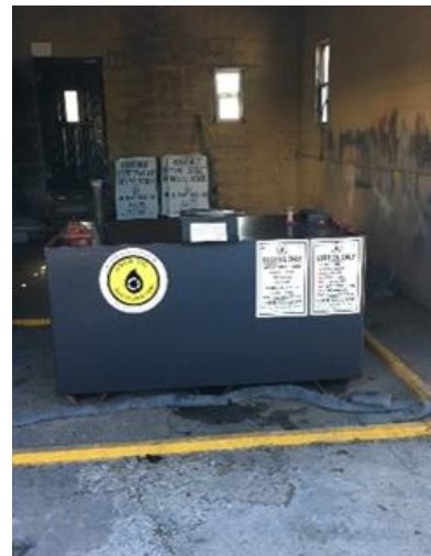
Hyattsville - DPW

During 2022, 433,084 gallons of used oil and 28,336 gallons of used antifreeze were collected from Program-sponsored locations. Additionally, during this period, 195 drums of used oil filters were collected for recycling.