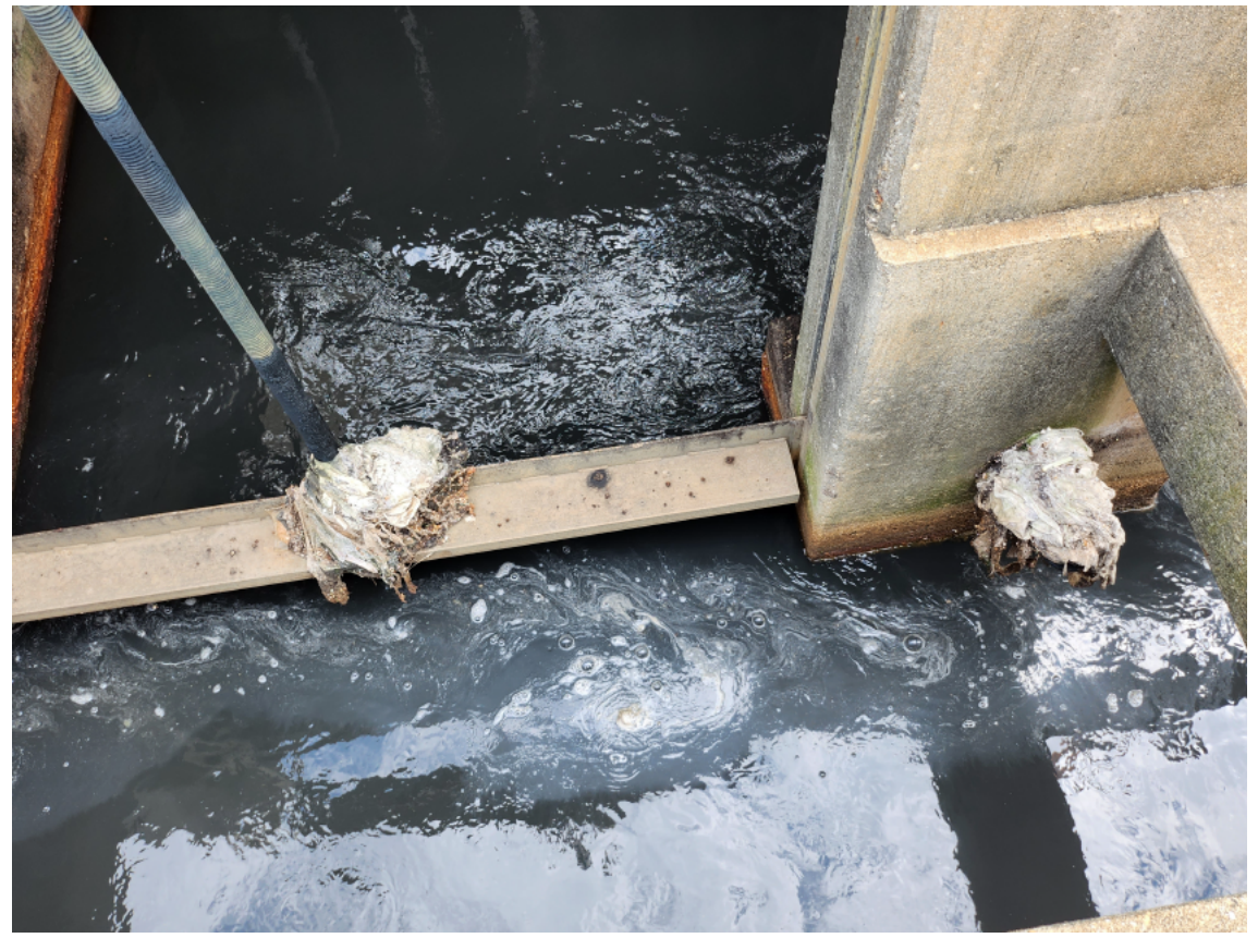
8/24/22 Trash and scum in effluent from PSTs.

Facility Address: 3501 Asiatic Ave, Curtis Bay, MD 21226