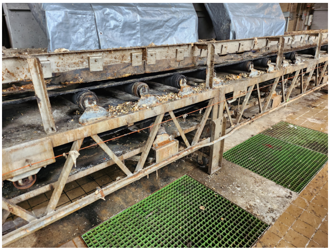
8/24/22 Trash conveyor belt.