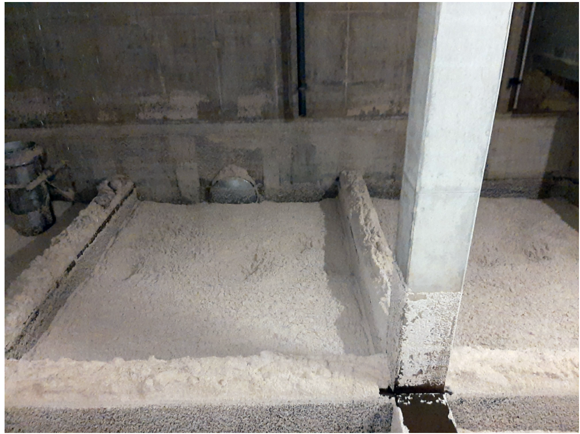
7/7/22 BAF mud well containing a heavy layer of media.

Facility Address: 3501 Asiatic Ave, Curtis Bay, MD 21226