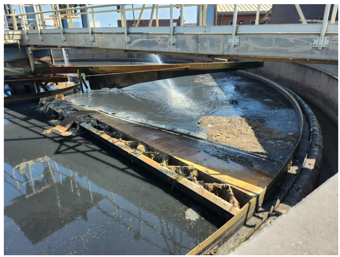
8/24/22 GST #1.