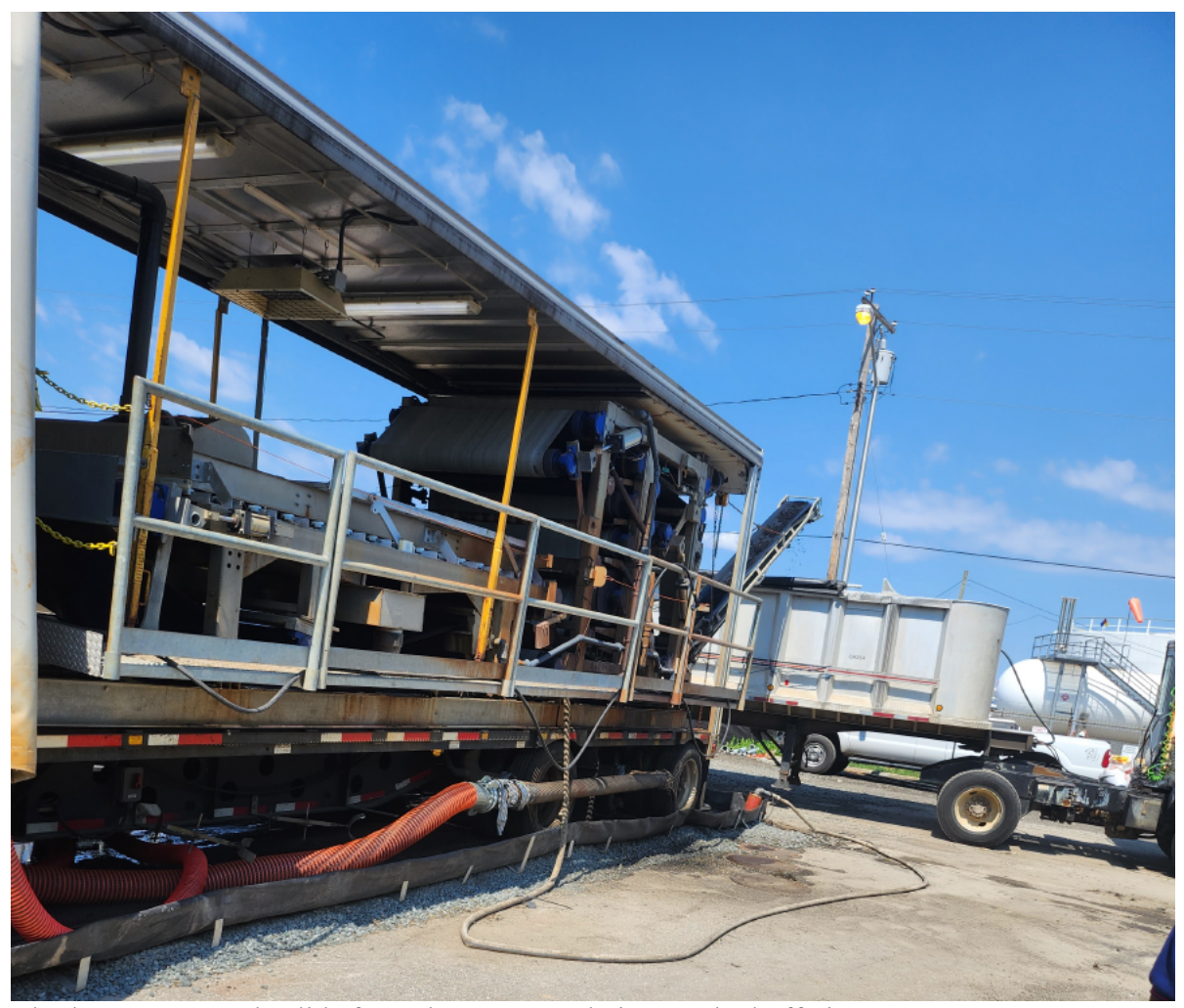
8/24/22 De-watered solids from the SBTs are being trucked off-site.

Facility Address: 3501 Asiatic Ave, Curtis Bay, MD 21226