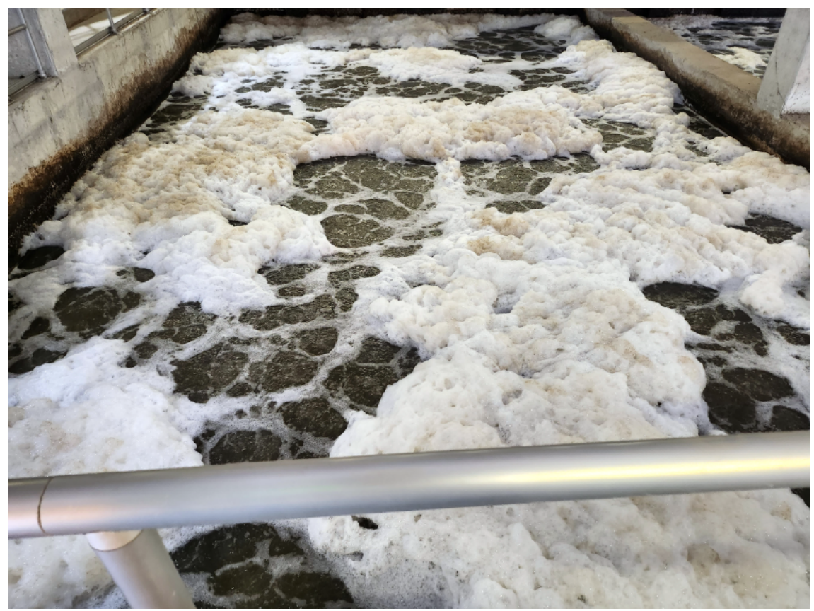
8/24/22 BAF cell. Note, excessive foaming.