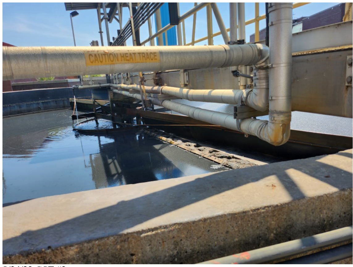
8/24/22 GST #2.

Facility Address: 3501 Asiatic Ave, Curtis Bay, MD 21226