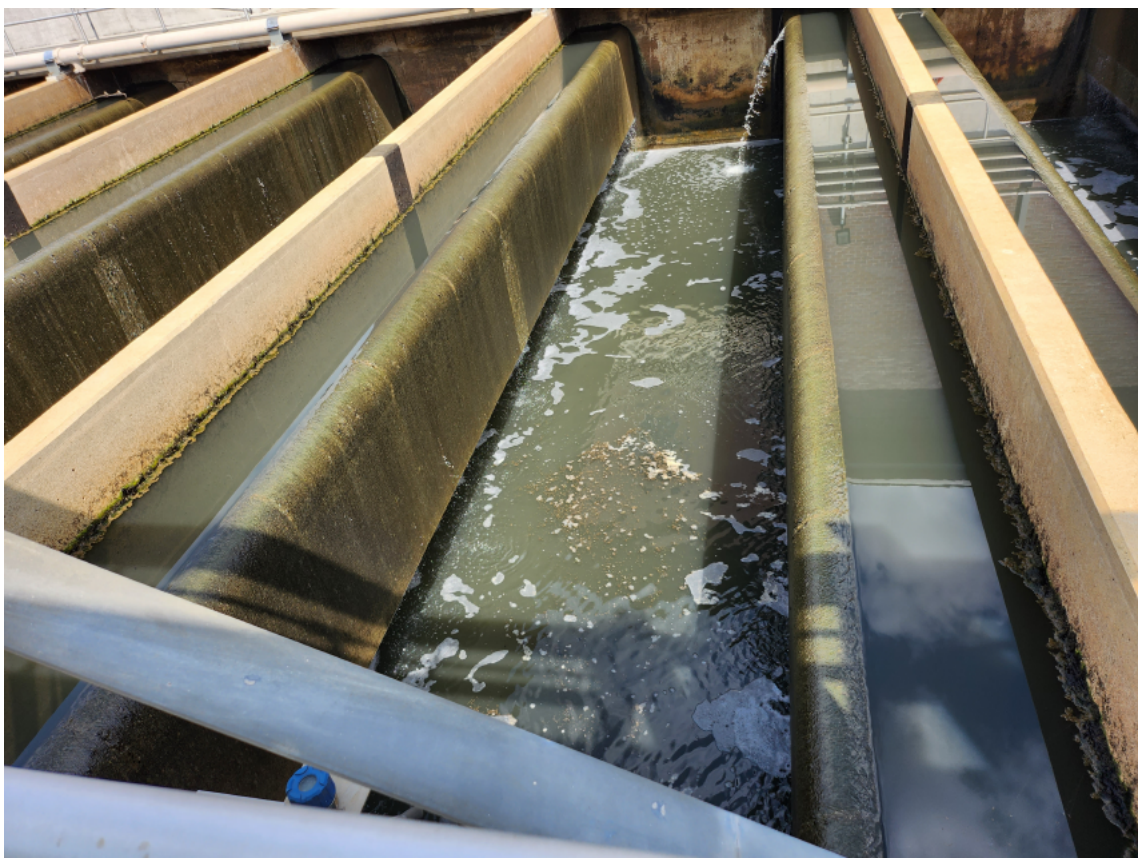
8/24/22 DNF: A small amount of floating solids was observed.