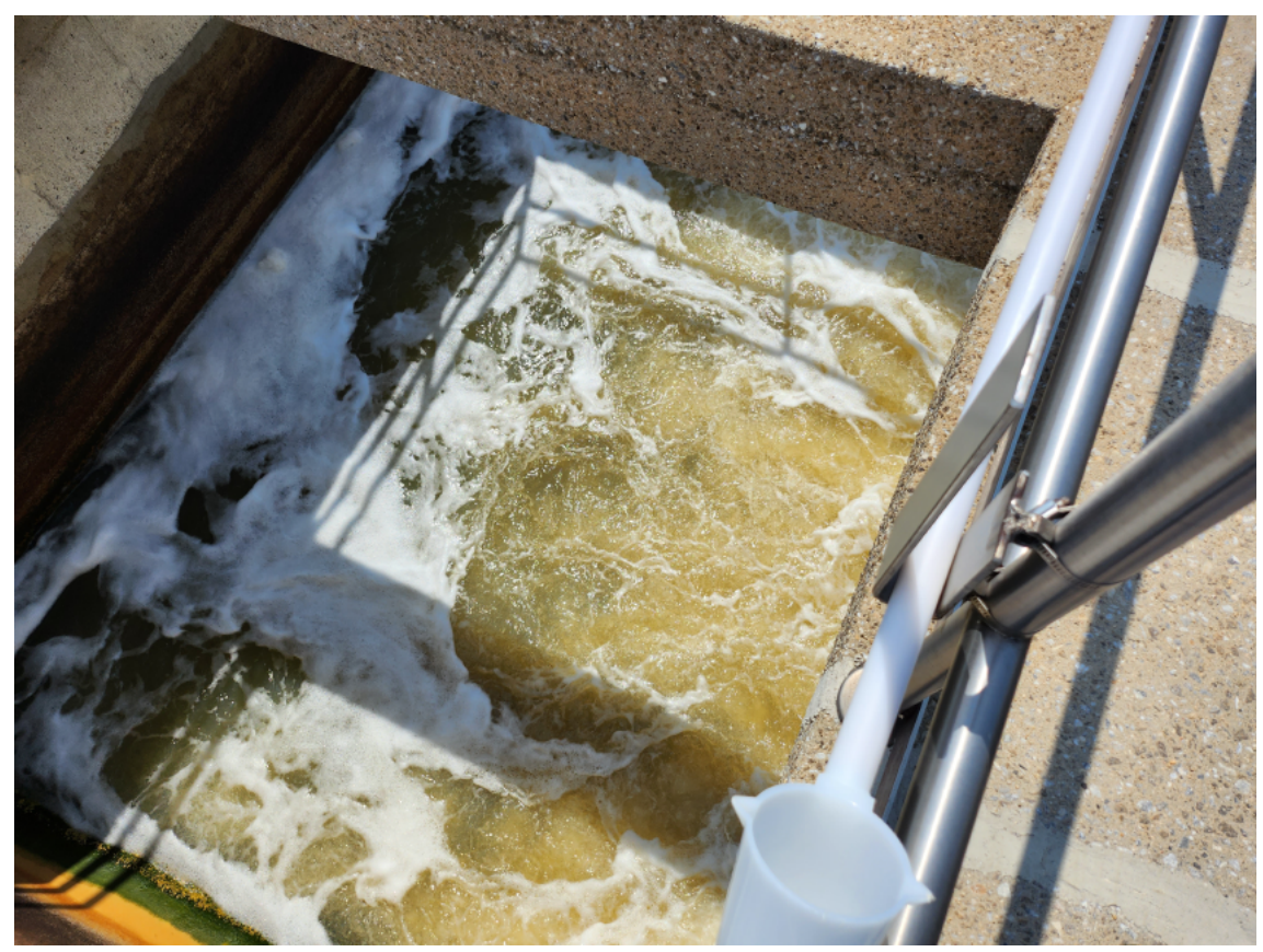
8/24/22 Final effluent.