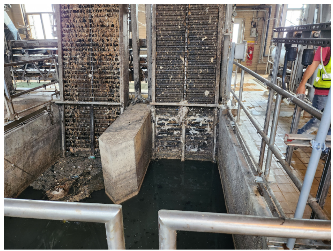
8/24/22 Fine screen units out of service.

Facility Address: 3501 Asiatic Ave, Curtis Bay, MD 21226