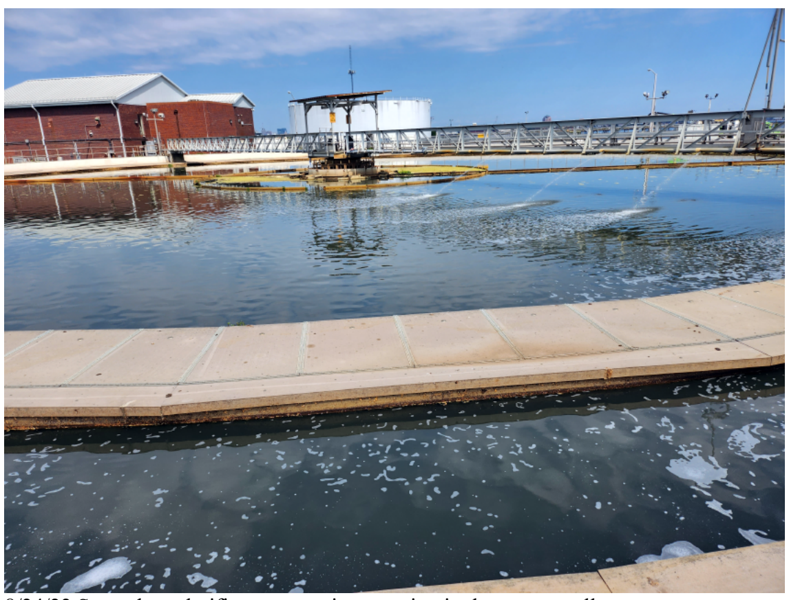
8/24/22 Secondary clarifier – vegetation growing in the center well.

Concerns: Routine maintenance required and vegetation growing in the clarifiers.