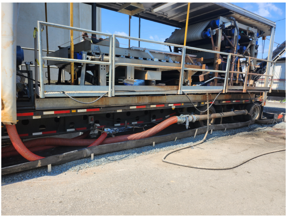
8/24/22 Portable belt press at the SBTs.