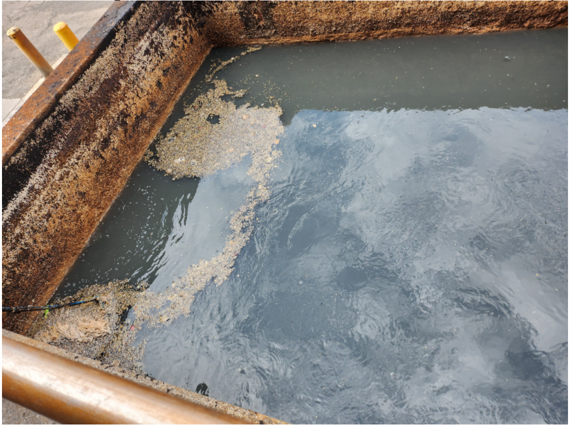
8/24/22 Influent tank.

Concerns: During the unannounced inspection, I find that this area is not maintained properly.